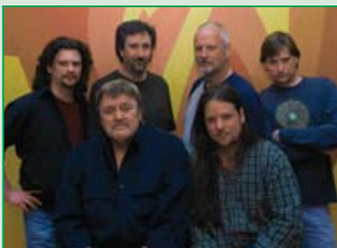
Atlanta Rhythm Section

Working Class Villain, a very up and coming band in the Cincinnati area, will open the festivities on July 12th. Local favorites The Vibe will continue the great musical action. Rock and Roll Hall of Famer DAVE MASON, a founding member of the British super group TRAFFIC, will close the show. A true rock legend, DAVE MASON, has had many hits, including We Just Disagree, Feelin' Alright, and many TRAFFIC and solo albums. He has also been a featured performer on albums by some of rock's biggest names, including Paul McCartney, George Harrison, The Rolling Stones, Jimi Hendrix, Eric Clapton, and many, many more. It is a privilege to have this member of the Rock and Roll Hall of Fame as a performer at this year's Festival.